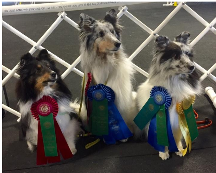
The Ormsby Sheltie Trio